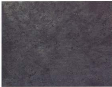
Completely covered in mill scale