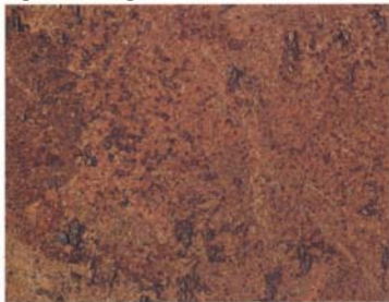
Mill scale has flaked off complete rusting has taken place